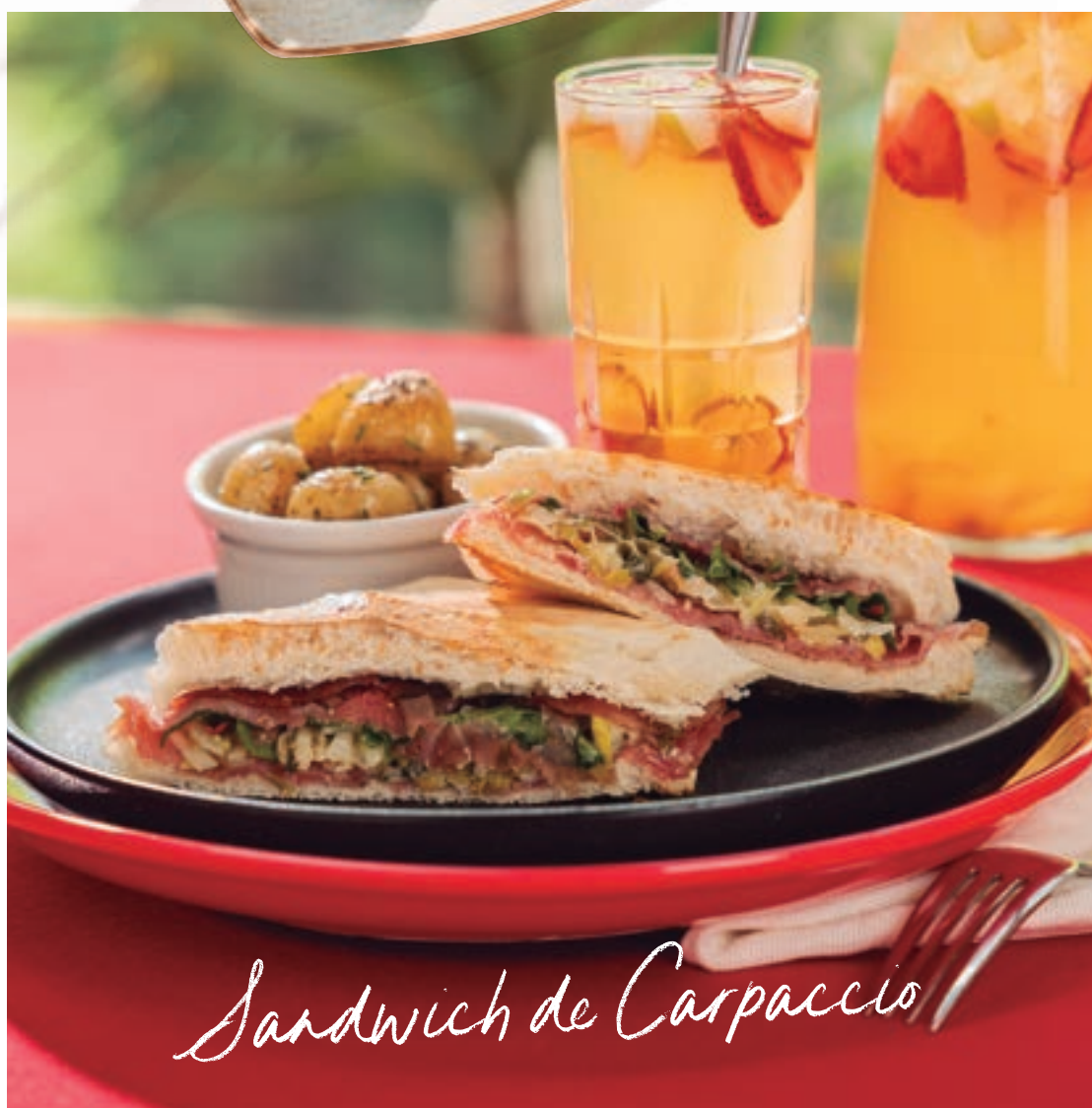
Sandwich de Carpaccio